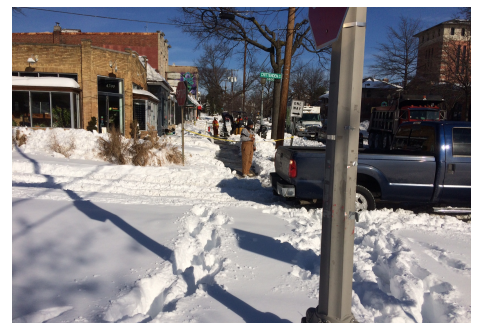
The neglected walkways on upper 14th Street last January, more than 48 hours after the snow storm ended, made it very hazardous and nearly impossible to navigate the street safely.

The elderly and residents with disabilities may apply for an exemption from the shoveling requirement by calling 311 to apply. They can also contact their block captain or a member of the SSNA Executive team for help clearing their walkway. Go to ssna-dc.org to find your block captain.