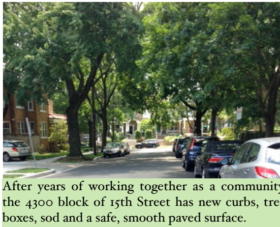
After years of working together as a community, the 4300 block of 15th Street has new curbs, tree boxes, sod and a safe, smooth paved surface.

Our efforts on these and other issues continue. For example, in this issue of the Heights, we report on new proposed legislation dealing with developers, abandoned homes, illegal construction, etc. The Association is preparing testimony in support of this legislation and gathering neighbors to testify. See also our calendar of exciting summer events.