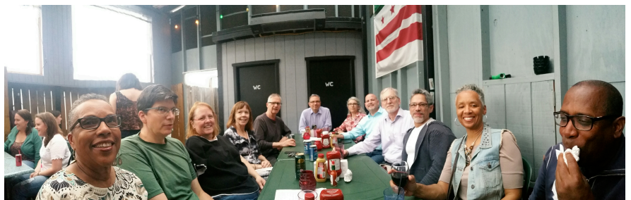
A great way to spend April Fool's Day! Friends and neighbors at a 16th Street Neighborhood Association happy hour. Join us for the next ones, July 15 & August 19!